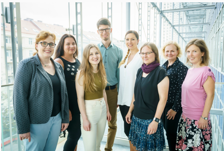
Part of our library team

Blog – interesting and useful information can be also found in the Blog section. We are pointing out educational and interesting events of other institutions, publishing manuals etc.